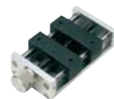
TR-1/4/5A/5 Chuck for round rod