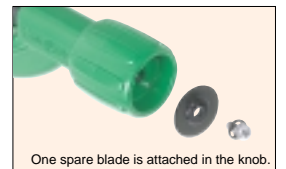
One spare blade is attached in the knob.